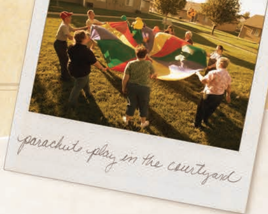
parachute play in the courtyard